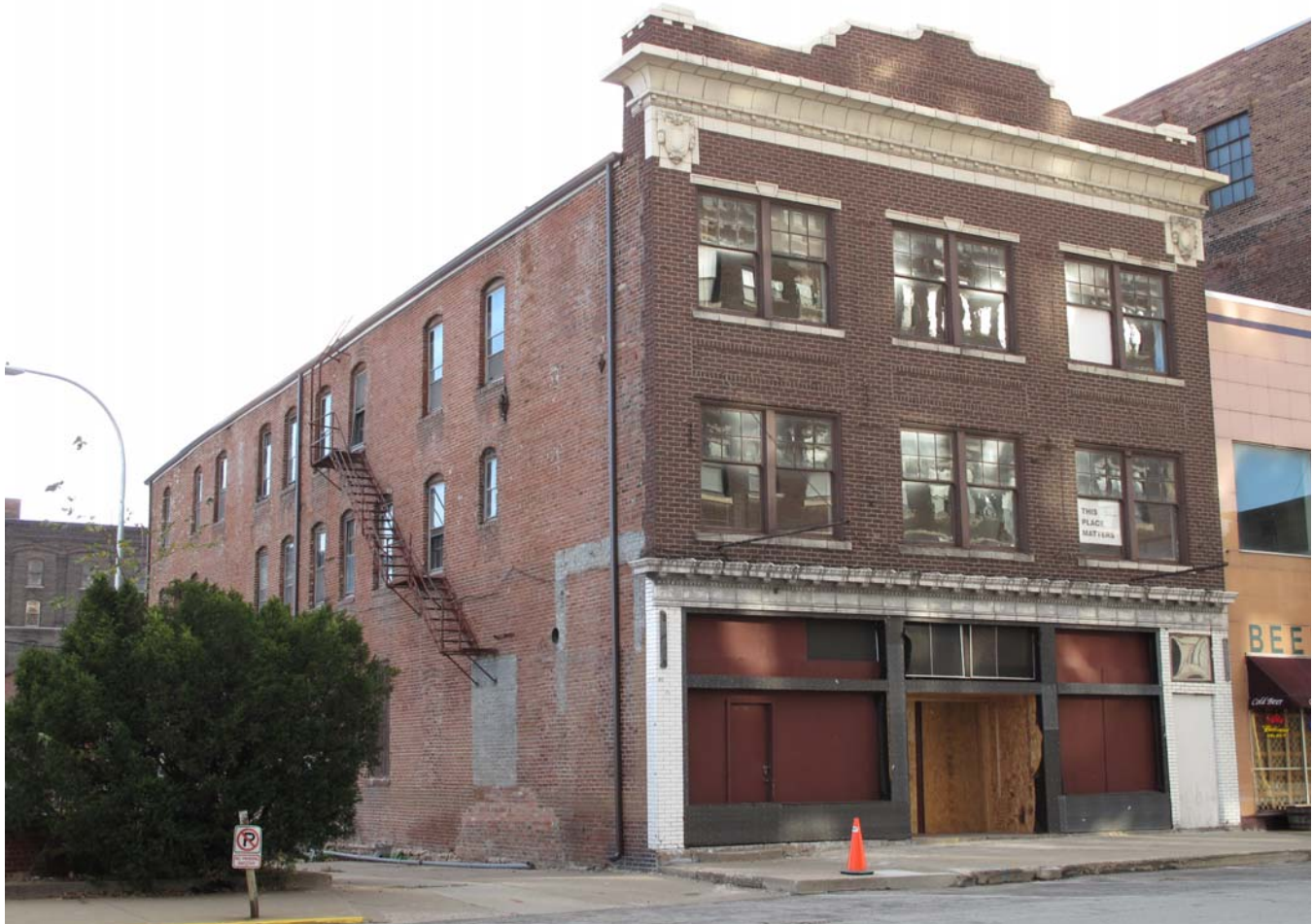
Building, looking southwest November 2, 2009 R.L. McCarley

Commercial building Des Moines Name of Property County 213-215 Valley Burlington Address City