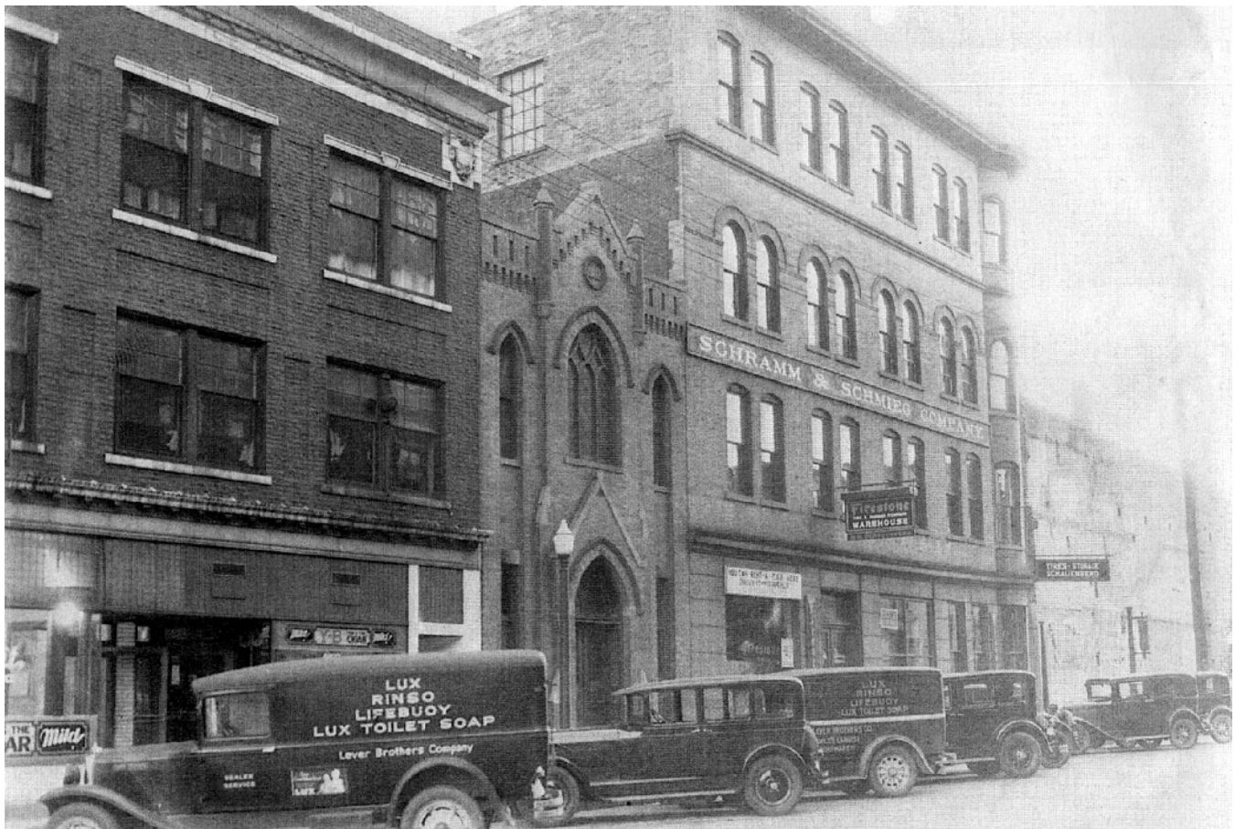
1920s – building on left