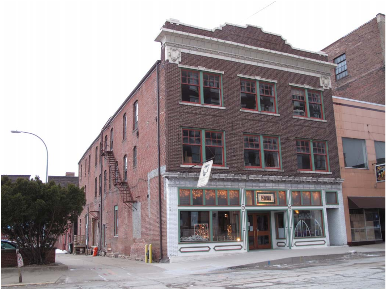
Photograph 29-01638-001 – North elevation, looking southwest.