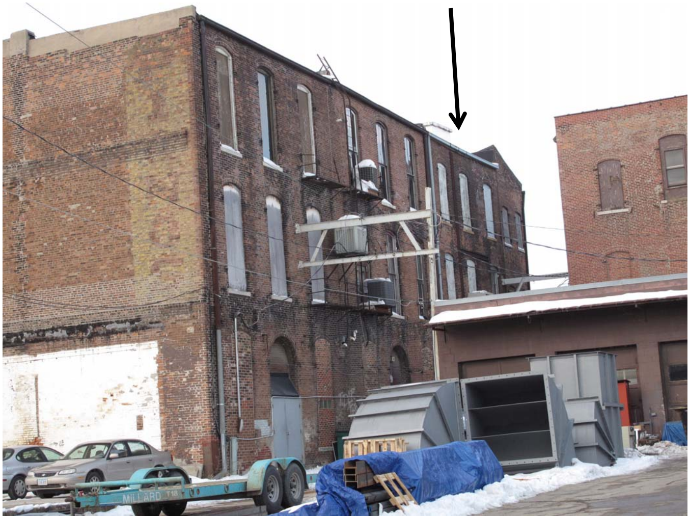
Building, looking northwest January 12, 2010 R.L. McCarley