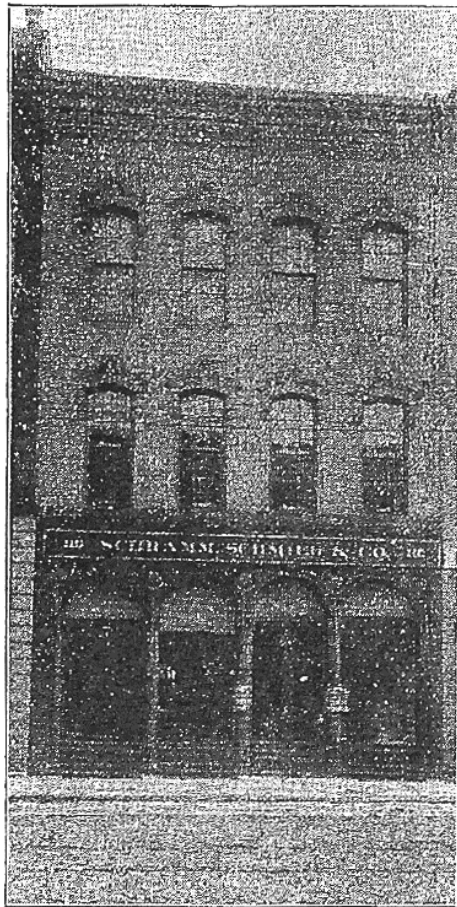
Schramm & Schmiegl in 1896 Souvenir of Burlington , page 72.