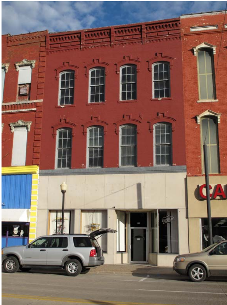
Building, looking east November 2, 2009 R.L. McCarley