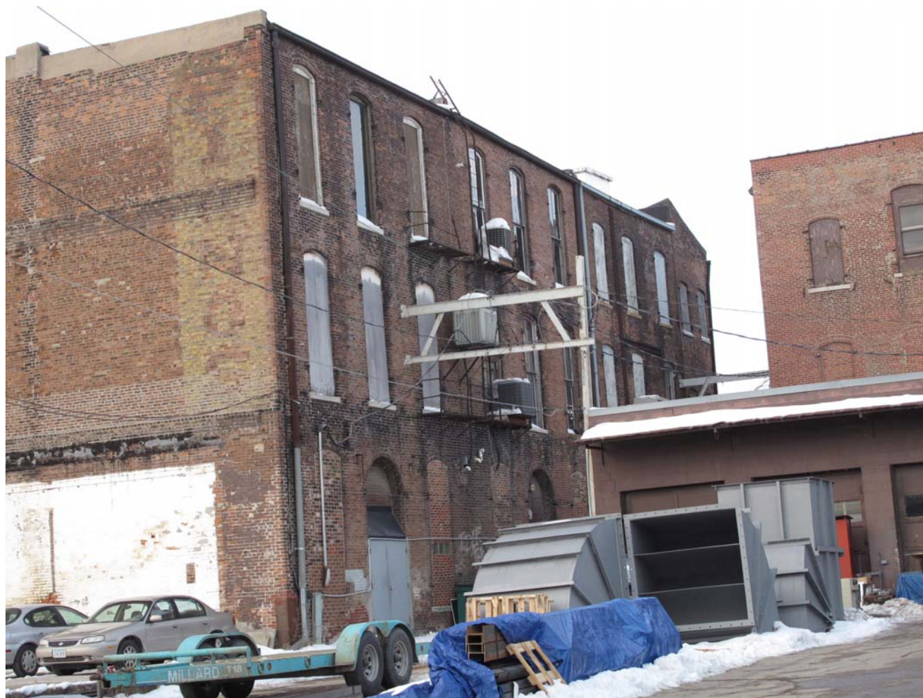
Building, looking northwest January 12, 2010 R.L. McCarley