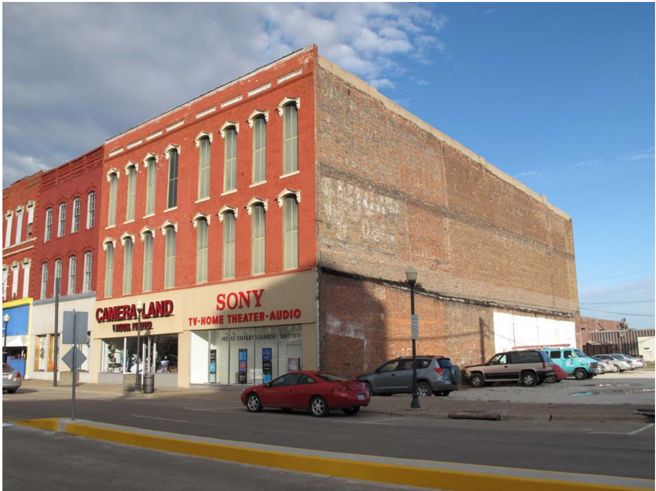
Building, looking northeast November 2, 2009 R.L. McCarley