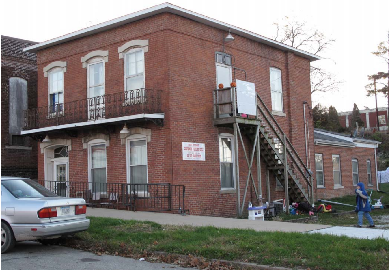
House, looking southwest November 2, 2009 R.L. McCarley