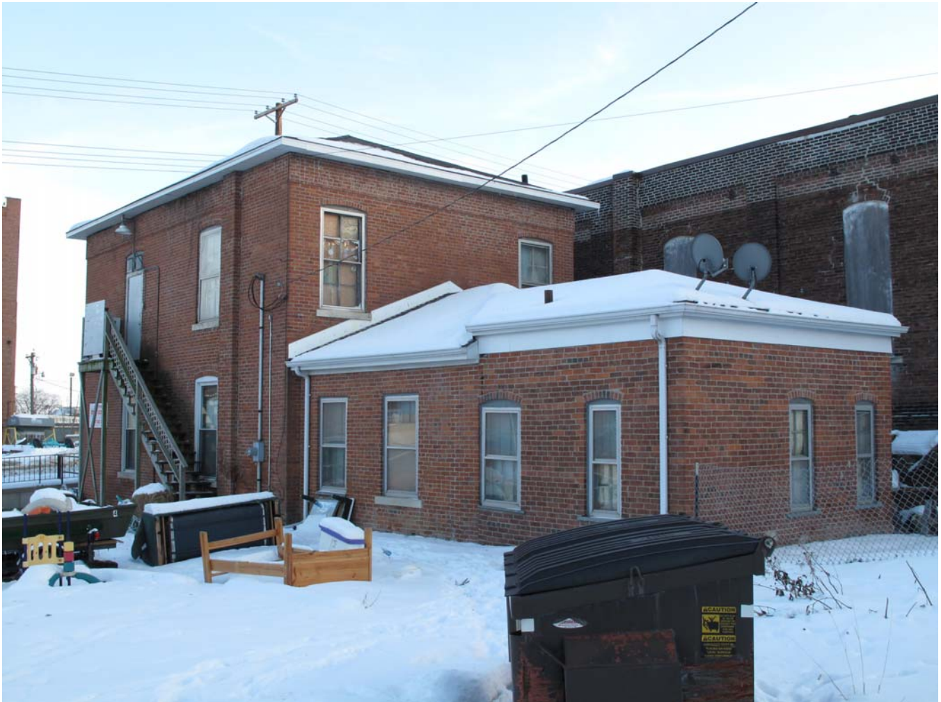
House, looking southeast January 12, 2010 R.L. McCarley