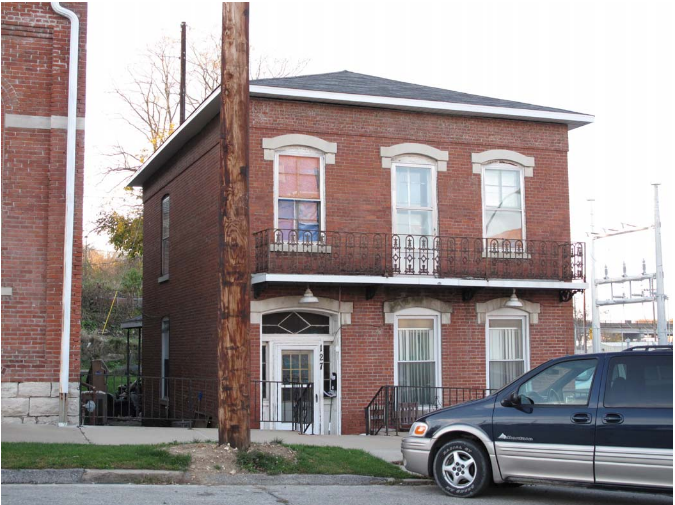
House, looking northwest November 2, 2009 R.L. McCarley