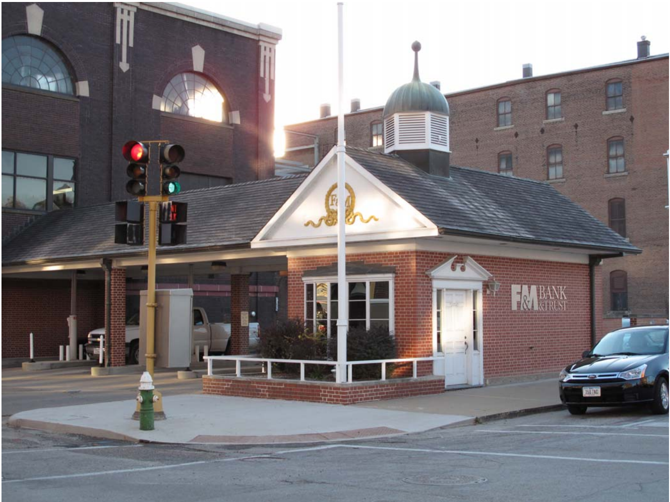
Bank, looking southwest November 2, 2009 R.L. McCarley