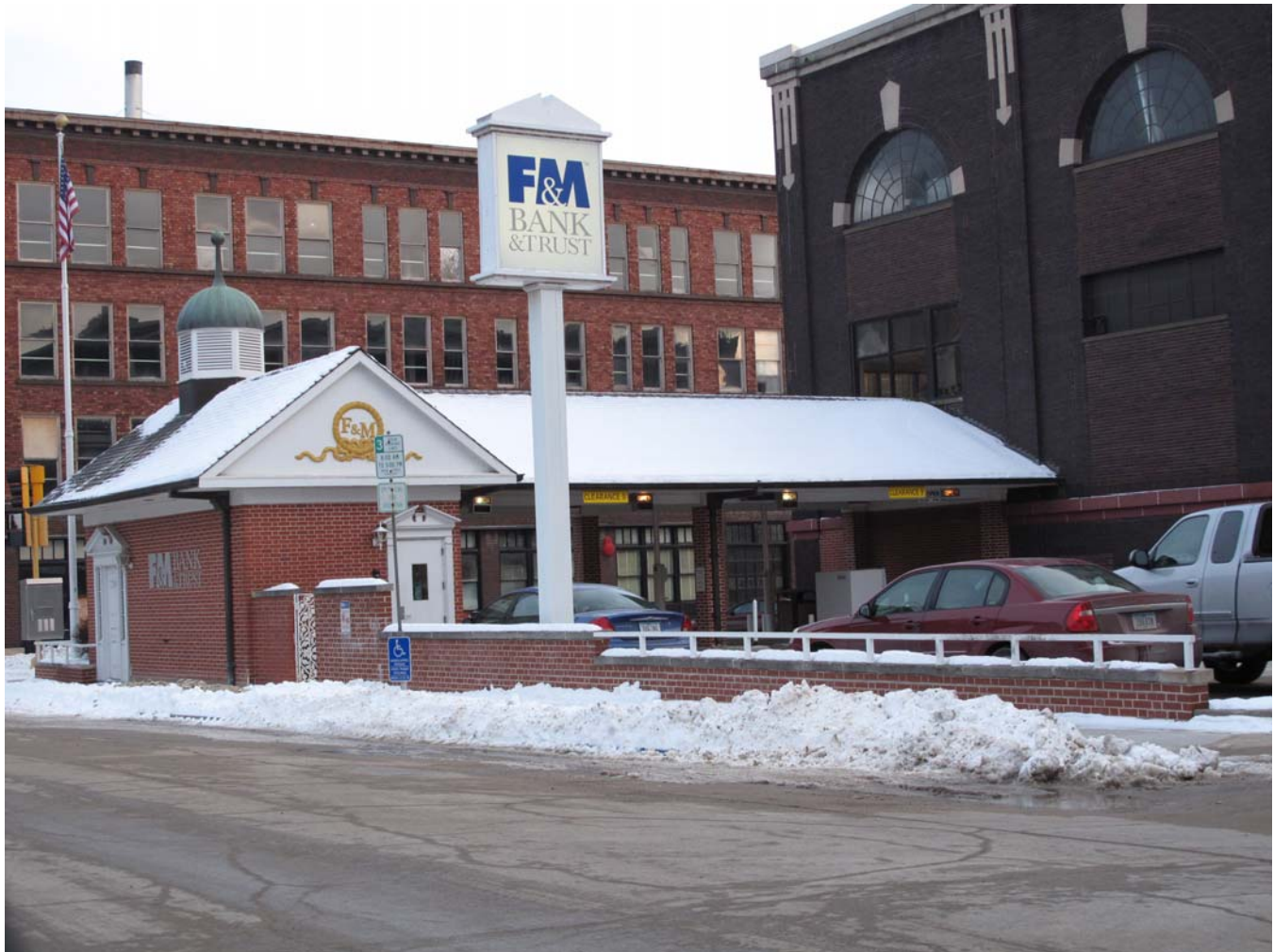
Bank, looking southeast January 12, 2010 R.L. McCarley