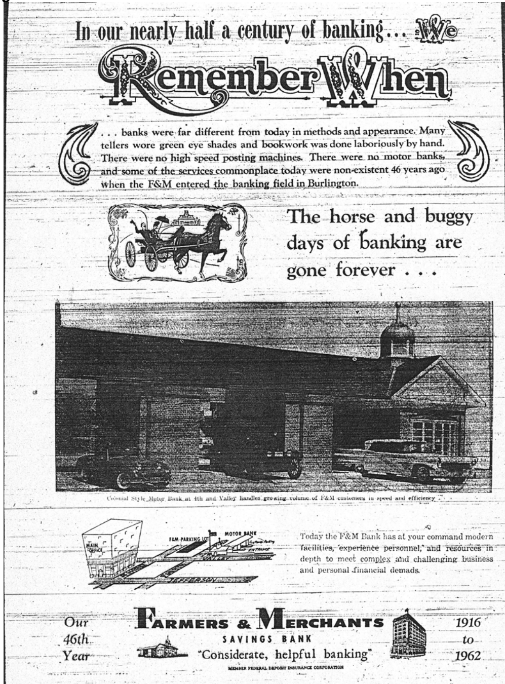
Ad in Hawk-Eye on July 7, 1962, sec 2, page 40