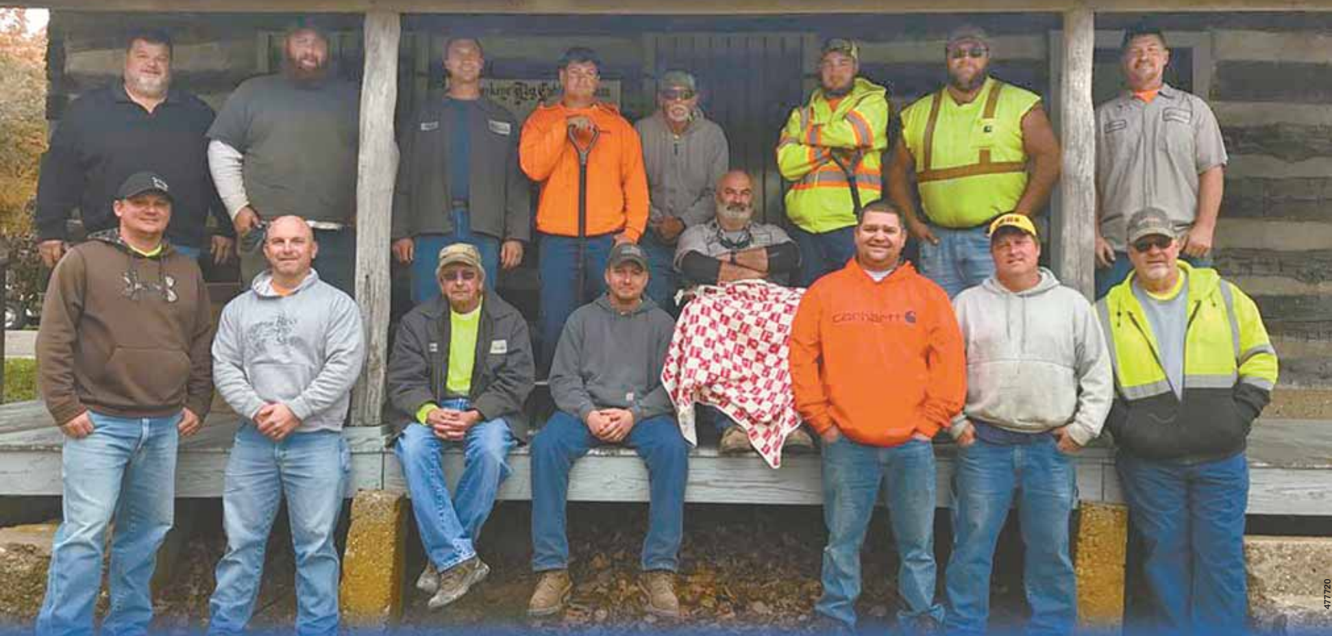
City of Burlington Employees from the Street & Sewer Division