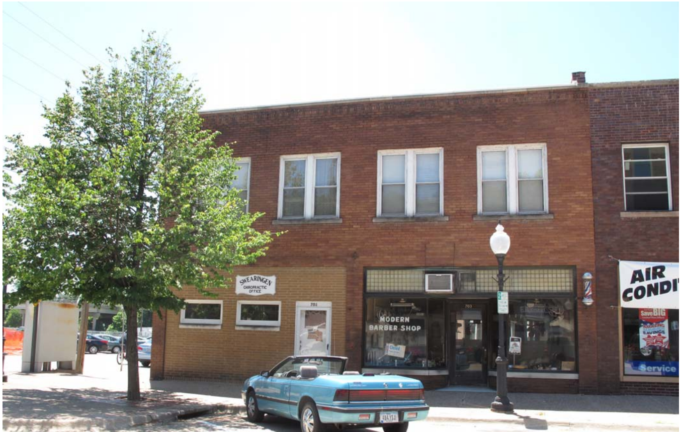
Photograph 29-03678-002 – North elevation, looking south