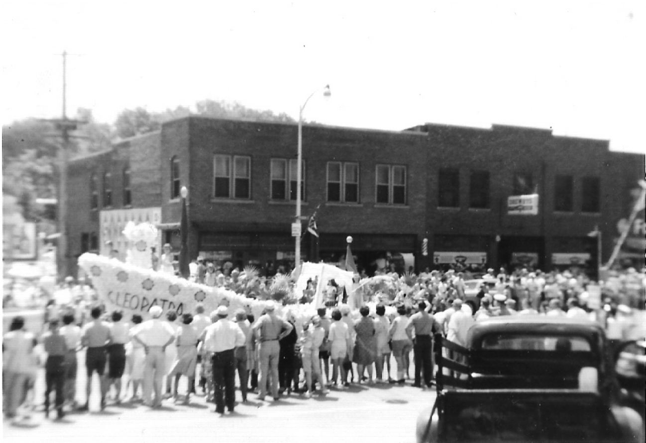
700 block of Jefferson in 1950s