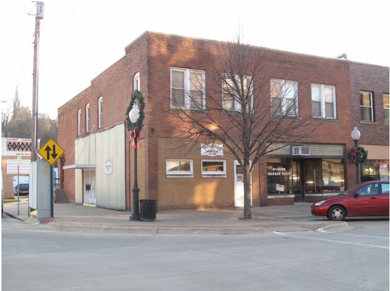
Photograph 29-03678-001 – East and north elevations, looking southwest