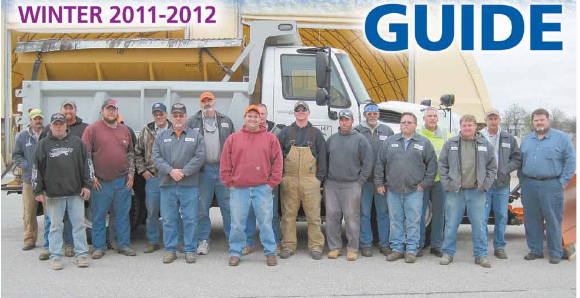
City of Burlington Employees from the Street & Sewer Division