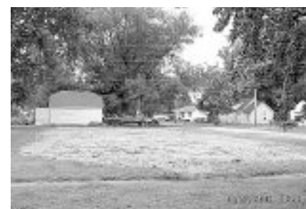
South 15th Street After