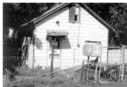
Little Ashmun Before