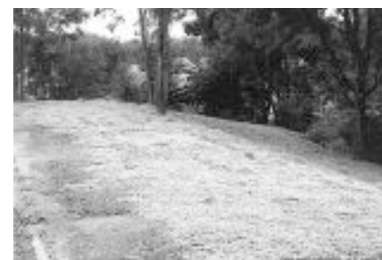
Little Ashmun After