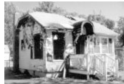
South 15th Street Before

A few pictures of these are provided. They show the property before the demolition and the clean site after the demolition.