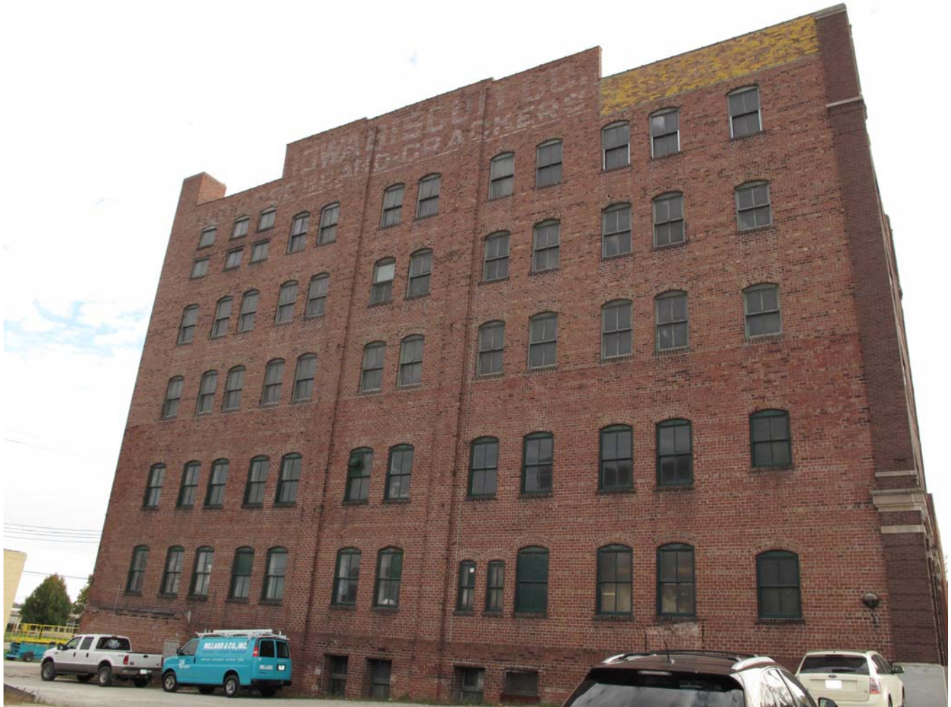
North elevation of building, looking south November 2, 2009 R.L. McCarley