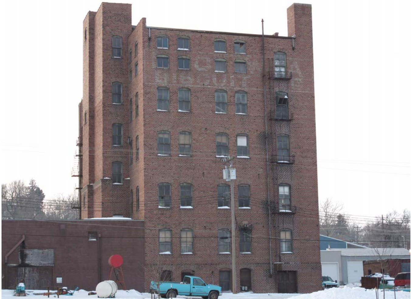
Rear (east elevation) of building, looking west January 12, 2010 R.L. McCarley