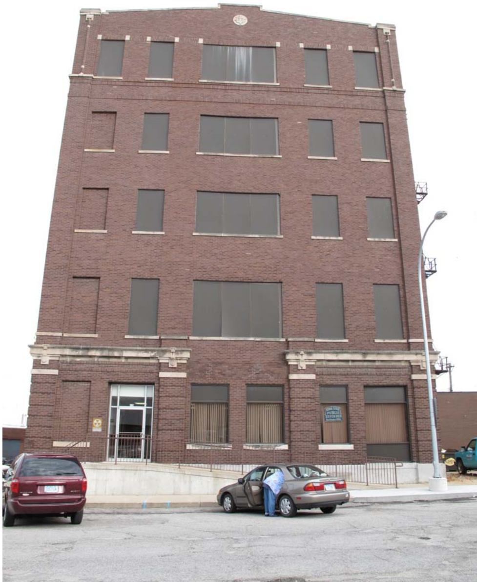
Façade of building, looking east November 2, 2009 R.L. McCarley