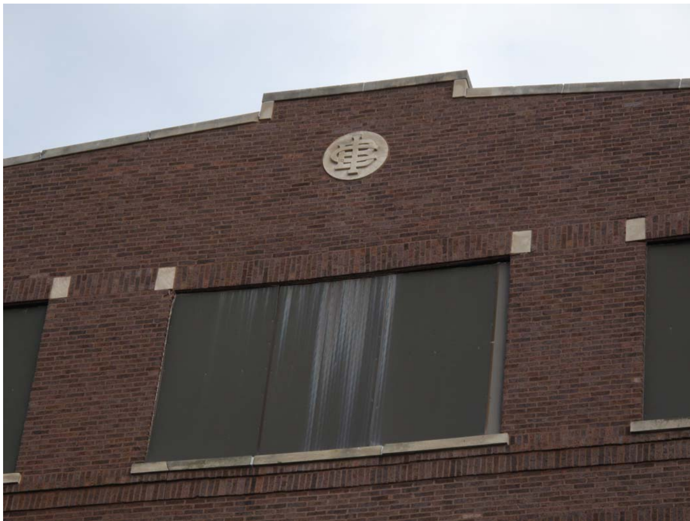
Detail of IBC logo on façade of building, looking east November 2, 2009 R.L. McCarley