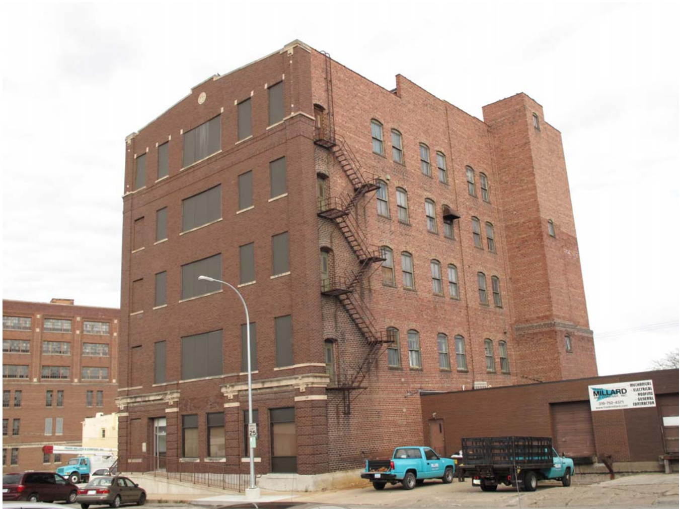
Building, looking northeast November 2, 2009 R.L. McCarley