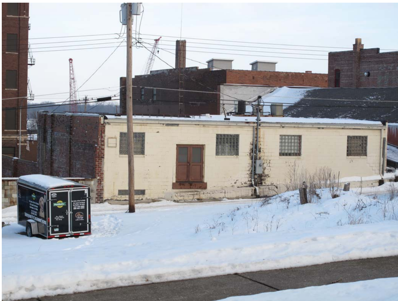
Rear of building, looking southeast January 12, 2010 R.L. McCarley