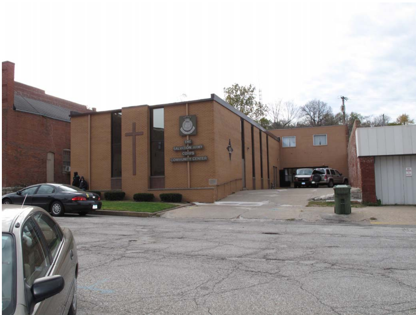
Building, looking southwest November 2, 2009 R.L. McCarley