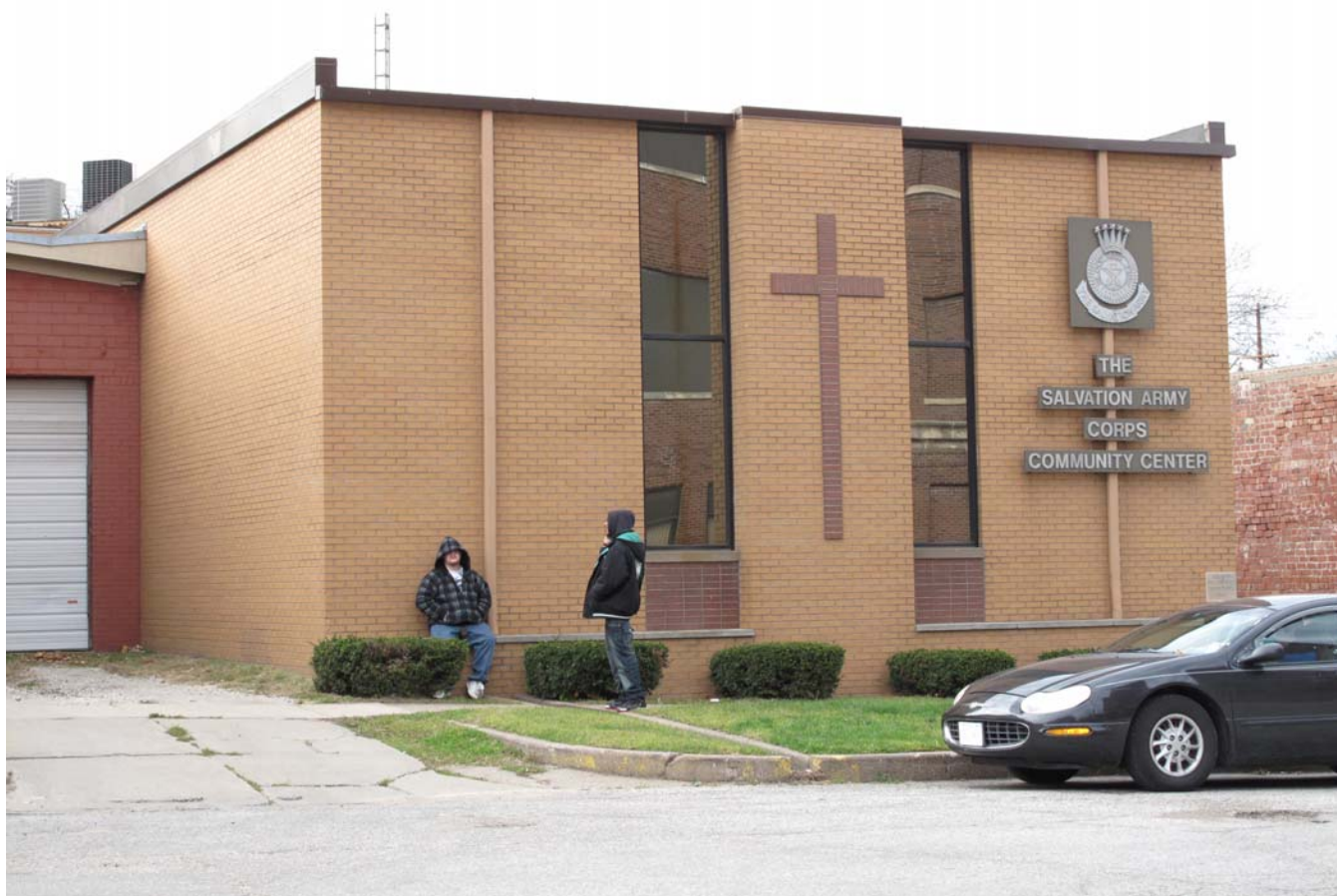
Building, looking northwest November 2, 2009 R.L. McCarley